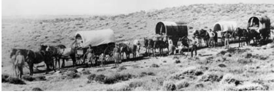
Pioneers spent months on the road, and many died.

Yet thousands of people were making this journey across the United States to California every year. The West Coast offered rich farmland, wonderful weather, and best of all, gold.