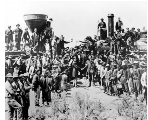
A special ceremony was held for the last spike.

Finally, in 1867, the track broke through the mountains, and the Central Pacific moved onto the deserts of Utah.