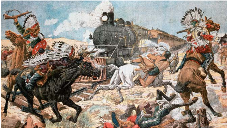
Native Americans prepare to raid a train.

The railroad also brought a flood of settlers to the plains. These settlers began farming and building their homes on land that had always been occupied by the Native Americans. The trains also brought litter, noise, air pollution, and prairie fires caused by sparks from the wood- or coal-burning engines.