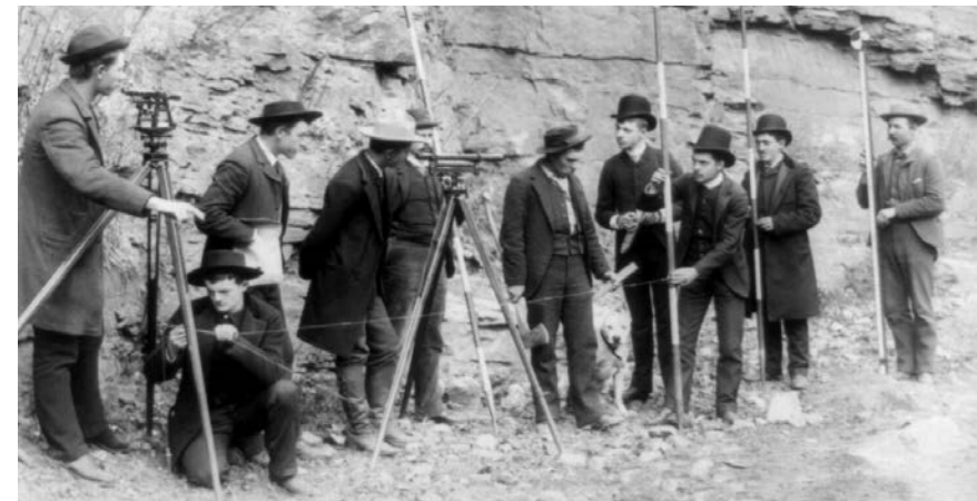
Surveyors carefully measure distance and elevation.

First, surveying crews studied the land, making measurements and putting stakes in the ground to mark exactly where the track would go. Second, a crew of graders went out. They removed any trees and other vegetation, filled in any low spots, and dug away any high spots to make a flat, smooth track. Across the flat land of the plains, the graders often had little to do.