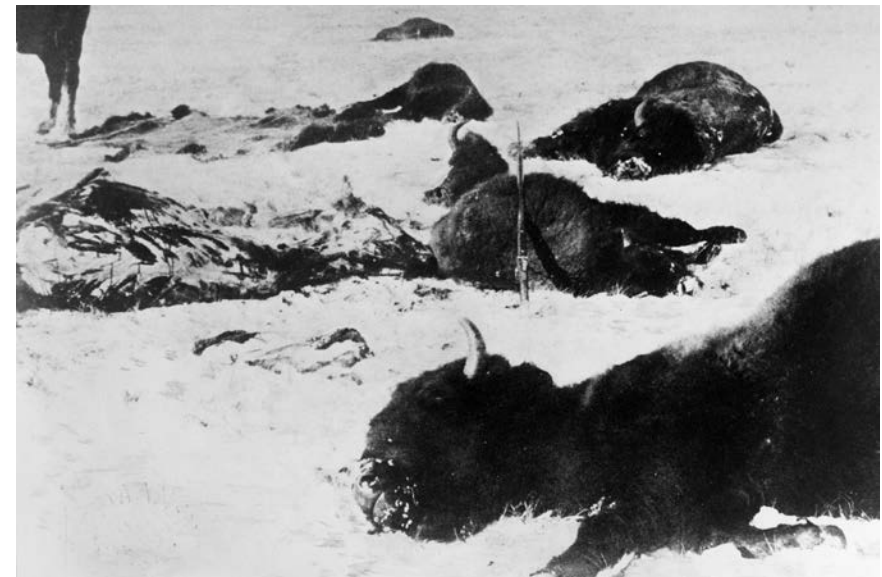
Settlers slaughtered the buffalo and left them to rot.

The Native Americans of the Great Plains understandably did not like the railroad. The buffalo, which the Native Americans depended on for their entire existence, would not travel across the tracks. Train passengers shot buffalo by the thousands just for sport. Within a few years, the animals were almost gone. Without the buffalo, the Native Americans could not survive as they had.