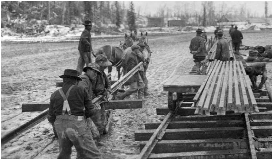
The men on the left are hauling a heavy iron rail.

Laying the track required several groups of workers. First, a team of men laid down wooden timbers called ties across the track. Next, other men dragged the heavy iron rails into place. Then, another group of men pounded in iron spikes and bolts that held the rails to the ties. Finally, a last group of men carried in sand and gravel, called ballast , to fill in around the new tracks. Using this system, the Union Pacific Railroad could lay 2 or 3 miles (3–5 km) of track in a single day.