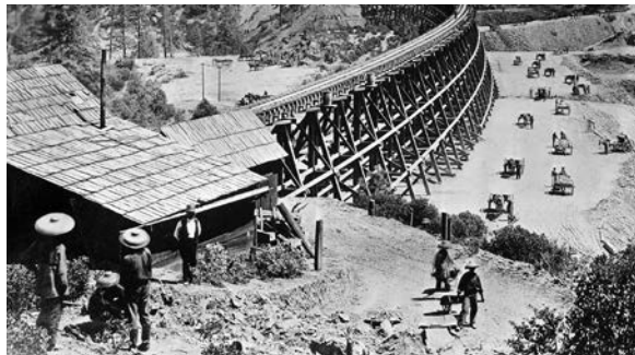
Chinese workers loading ballast to fill in under a track

into groups of laborers and foremen . They did not leave the job, no matter how difficult it was. The