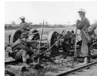
Civil War soldiers using railroad equipment

Building a railroad of that size was too expensive for any one person or company to